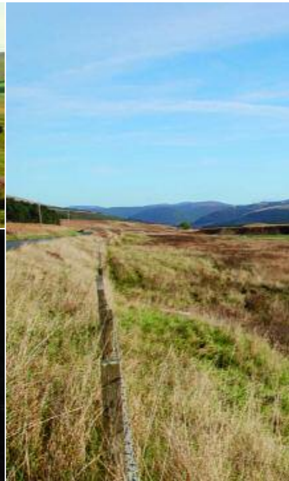
In the beginning: the source of the Tweed (above); walkers on the John Buchan Way (top); classic upper Tweed views (above middle); satisfied customers (opposite); canoe adventures on the River Till (below)

journeys of the wildebeest in Africa or the Arctic tern.”